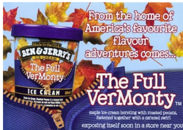
Figure 3: The Full Vermonty ice cream – references the popular British film, The Full Monty

Ben & Jerry's charitable work runs alongside its image as a consumer trendsetter. The company keeps abreast of the market and makes use of trends and fashions in each of its markets. For example, in 2001, to capitalize on the success of the film The Full Monty , it launched a new flavor called 'The Full Vermonty' onto the UK market, packed with maple syrup and pecan nuts from the company's home town.