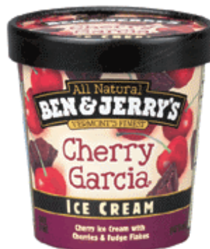
Figure 1: Ben & Jerry's Cherry Garcia ice cream – the brand retains the same name in every market

The company retains a strong global brand image by maintaining the same names and ingredients for its products from market to market e.g. Karamel Sutra and Cherry Garcia. The company keeps hold of consumer interest by continuing to innovate with new flavors and new concepts, such as its twisted ice cream, which has two different ice creams in a tub.